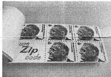
Booklet of 6 Cent Roosevelt Stamps