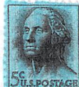
Scott US #1229 (Overall Tagging, shown under UV)