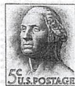
Scott US #1213 (Untagged)

"The same stamp may have been printed with and without these luminescent features, the two varieties would then be referred to as tagged and untagged, respectively." Scott #1213 and #1239 are examples.