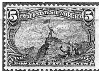
U.S. Trans-Mississippi stamp of 1898