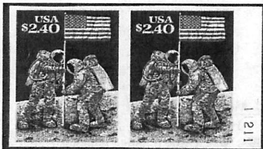
Imperf. Error (Omitted Perforations)

The appeal of EFO's is another example of the rule that "one man's trash is another man's treasure". Production Errors (e.g., Inverted Jenny) are generally the most popular (and valuable), but Design Errors make headlines too (e.g., Legends of the West). A related collecting/study area is Production Varieties, such as plate flaws, some of which qualify as EFO's as well."