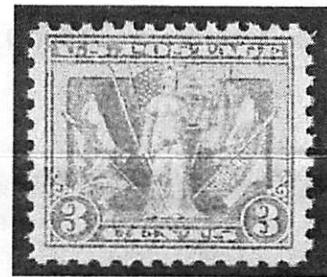
U.S. 537, Victory Stamp of WW I

These are definitely challenging times for the club, and indeed the nation as a whole. Many clubs and organizations are obviously facing many of the same issues that we're dealing with. Eventually, solutions will be found and things will return to a more normal state. Until then, we'll just have to be patient and do the best we can. Hopefully, by next year we can have regular meetings once again. Best wishes and health to all our members.